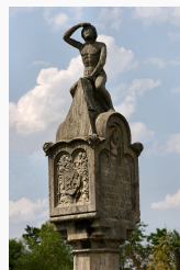
Bruckmanndl on top of Stone Bridge