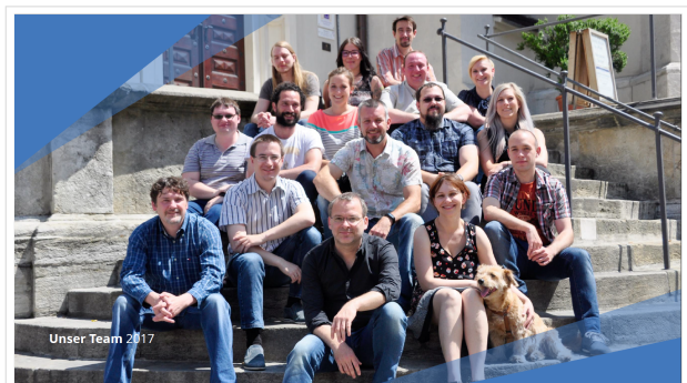
Our Team 2017