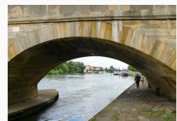
Stone Bridge detail