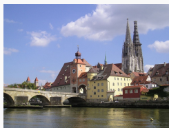
Bridge tower and Salt shed